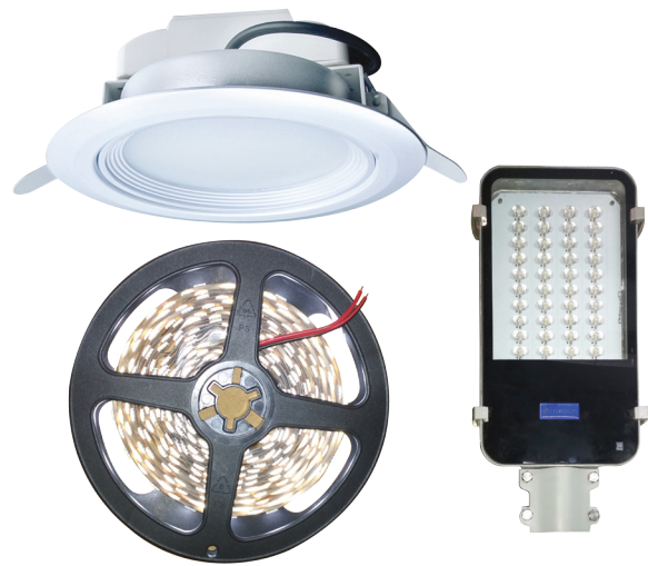
LED Lighting Solutions