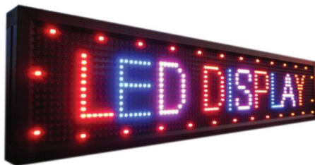
LED Display and Signages