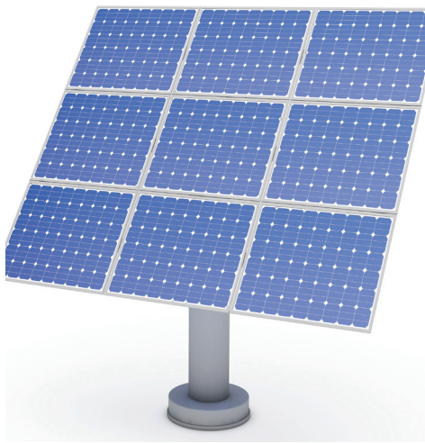
Solar Power Plants

Creation and innovation is what leads a company. Sinelab Technologies had inherited the genes of development and innovation from the initial stages. The entire development was segmented and thus the below mentioned are the various segments in which the product development had taken shape: